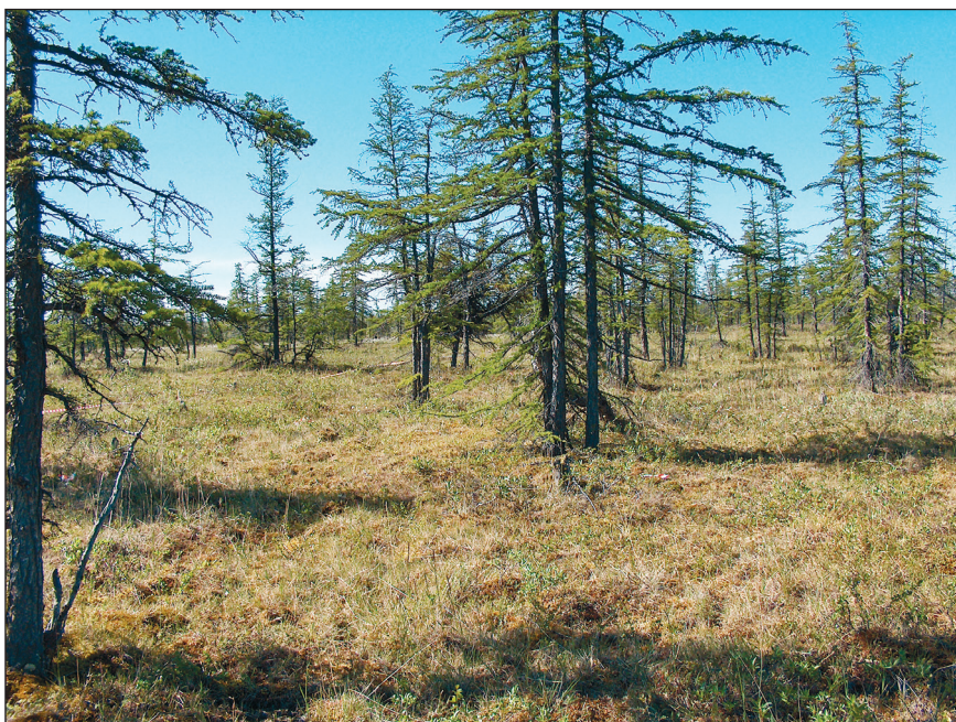
Fig. 3. Relatively healthy larch forest at the plate river terrace (Foto R. A. Ziganshin, 2008).

thick-needled pine may have it. In the locations of the dead forest it is clear that each tree has its own story of the death that is seen in the growth ring and crowns of trees. In one forest stand at the same time one can see not damaged, middle, hard damaged and dead trees of one species in the nearest