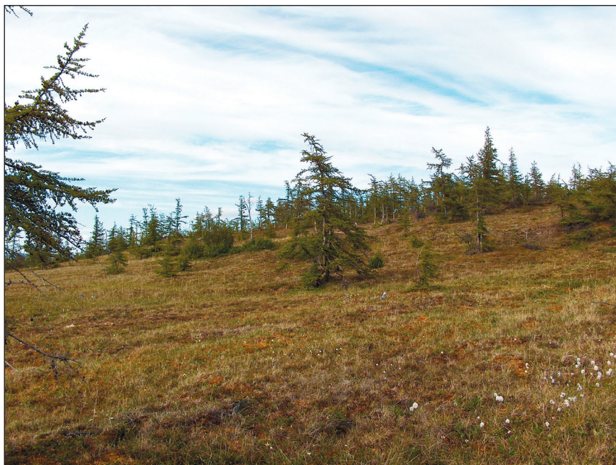
Fig. 2. Significantly damaged larch forest at the upper part of the slope (Foto R. A. Ziganshin, 2008).