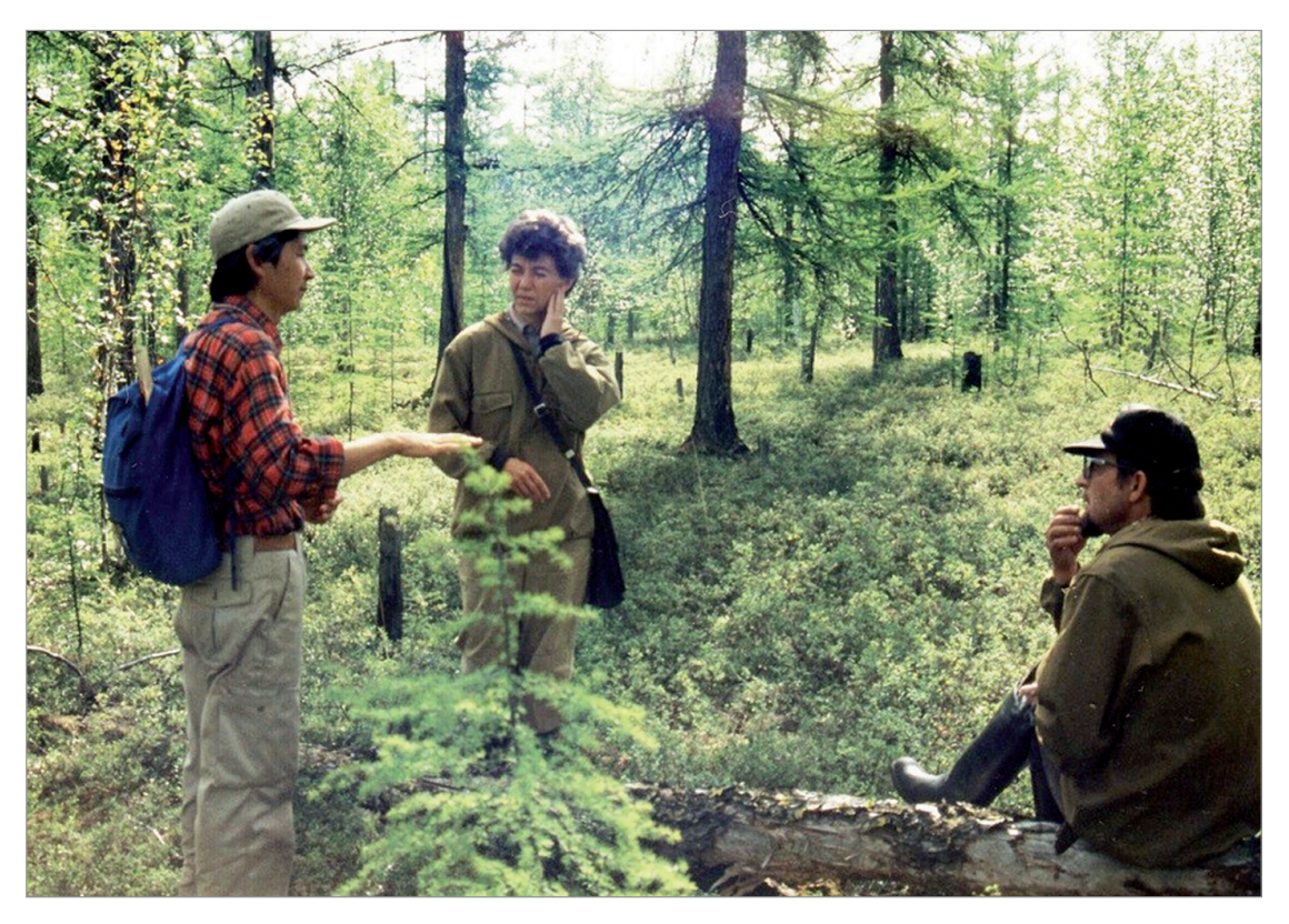
Fig. 2. Discussion on larch stand development and tree differentiation in permafrost forest in Evenkia.