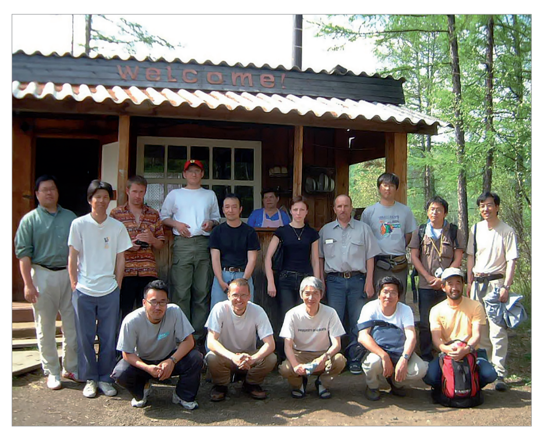
Fig. 5. The final photo at the end of the joint Russian-Japanese field studies at Evenkia Experimental station, in the settlement of Tura.