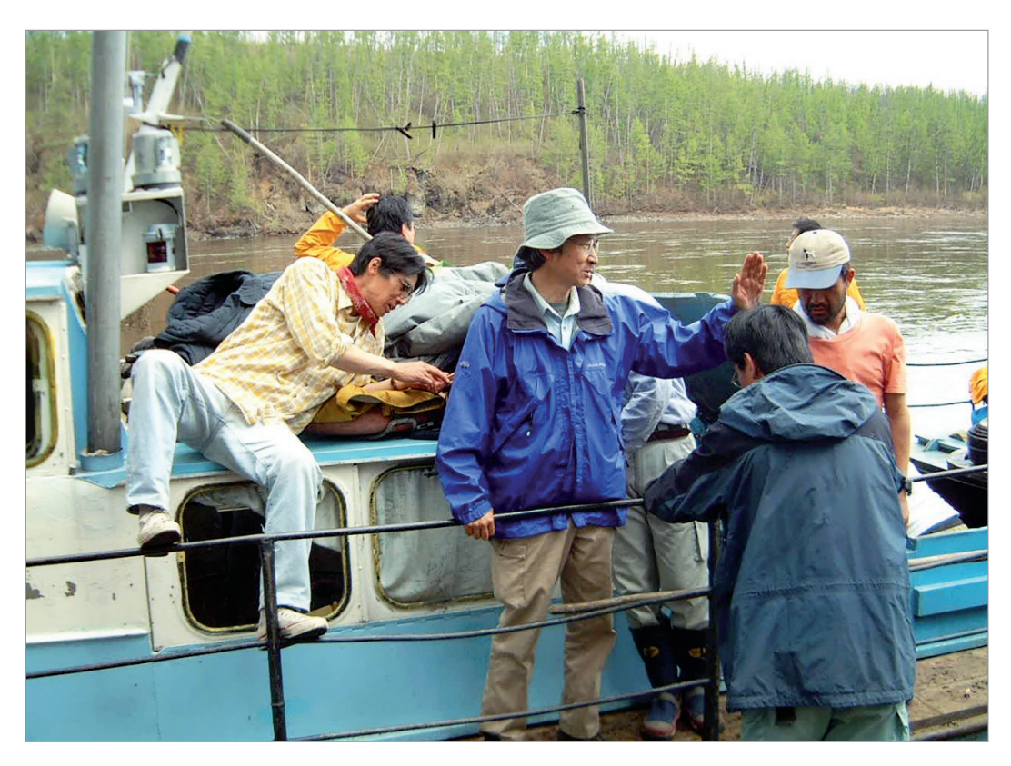
Fig. 4. Looking for suitable experimental plots: a travel by a boat on Nizhnyaya Tunguska is the best way to observe huge postfire areas.